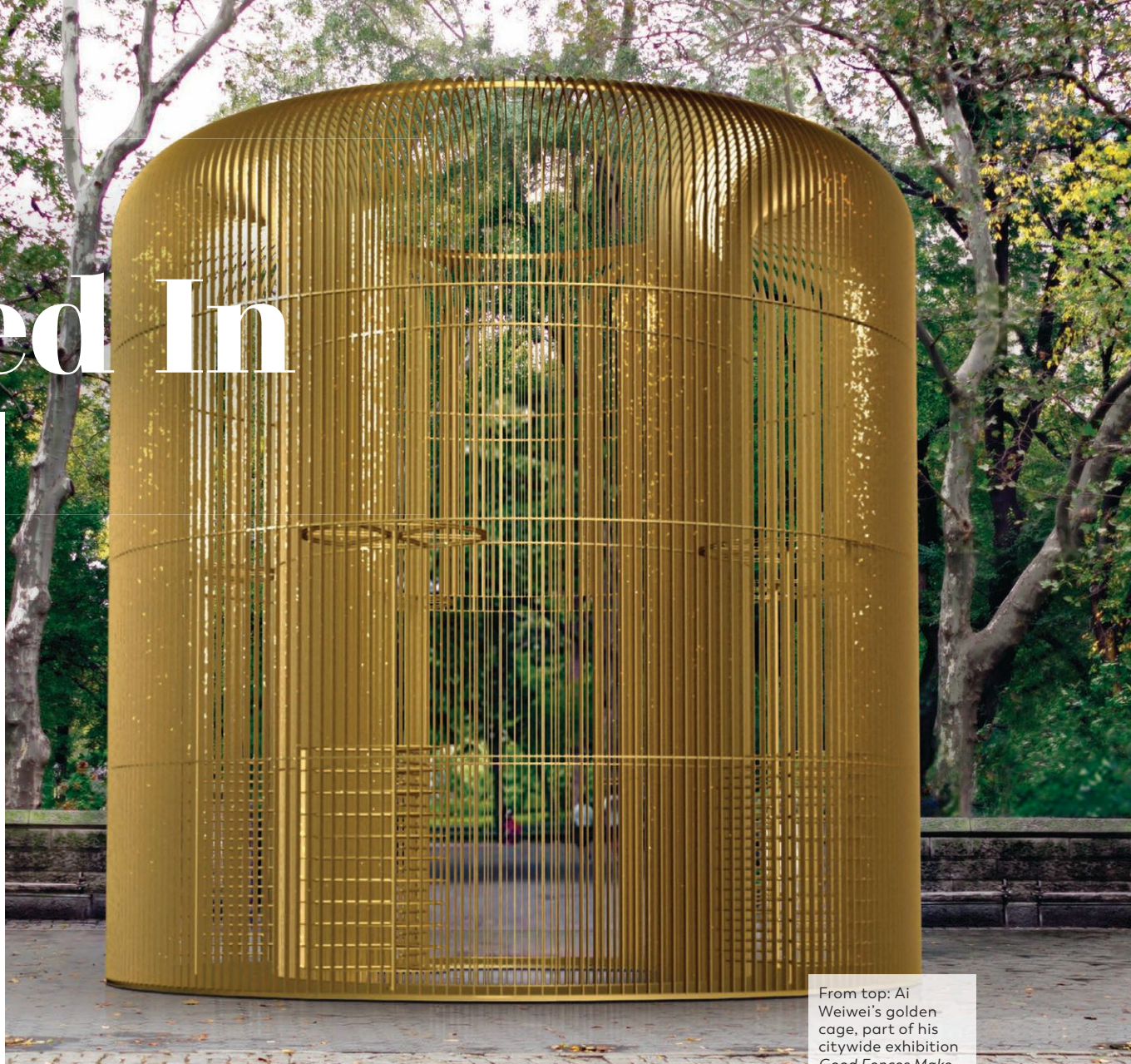
From top: Ai Weiwei's golden cage, part of his citywide exhibition Good Fences Make Good Neighbors , commands Central Park's Doris C. Freedman Plaza; a portrait of the artist, 2012.